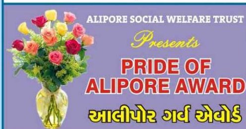
Pride of Alipore Award will be given every year to the Personality who has done Alipore Proud