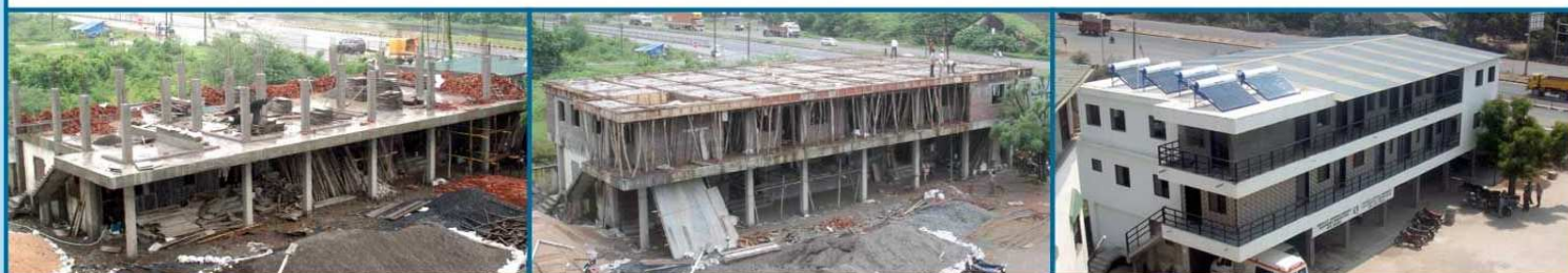
The Making of Alipore Hospital Annexe Building