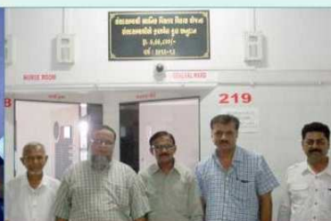
Mr C R Patil Contributes from his MP Fund.