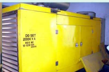
200 Kva Generator Given by Vasudhara Dairy Alipore