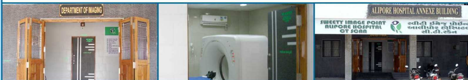
Newly Built CT Scan & MRI Facility