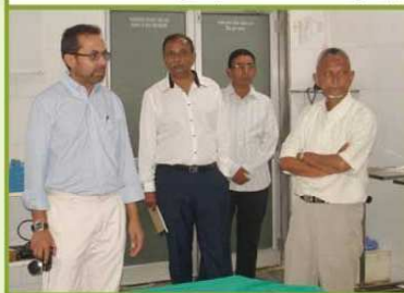
Jamnaba Hospital Delegation (Bardoli)