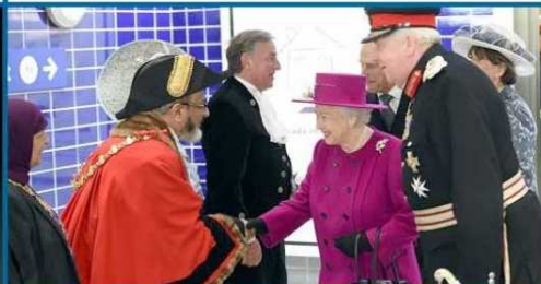
Mayor Salim Mulla (Aliporean) Welcomes Queen Elizabeth on her visit to Blackburn