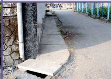
Covering the Open Sewerage Gutter in Alipore.