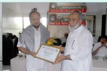
Donation from Navsari District Quarry Association