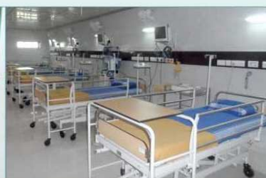
Inauguration of Second Floor Wards & 10 Bedded ICU.