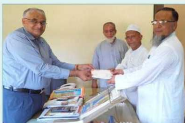
ASWT Trustees Receives Cheque from Gandevi Sugar Factory