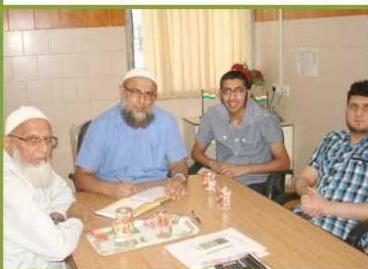
Mr. Y. S. Patel & Sons (UK)