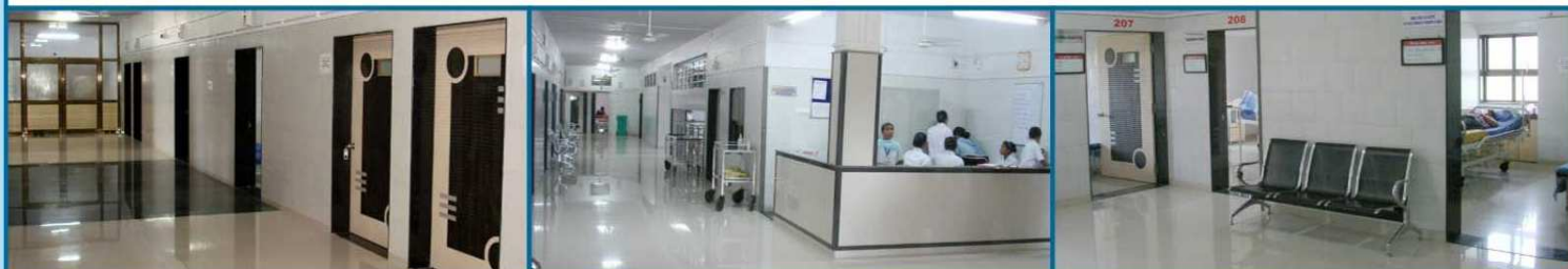
Newly Built and Renovated Spacious Wards Rooms on the Second Floor